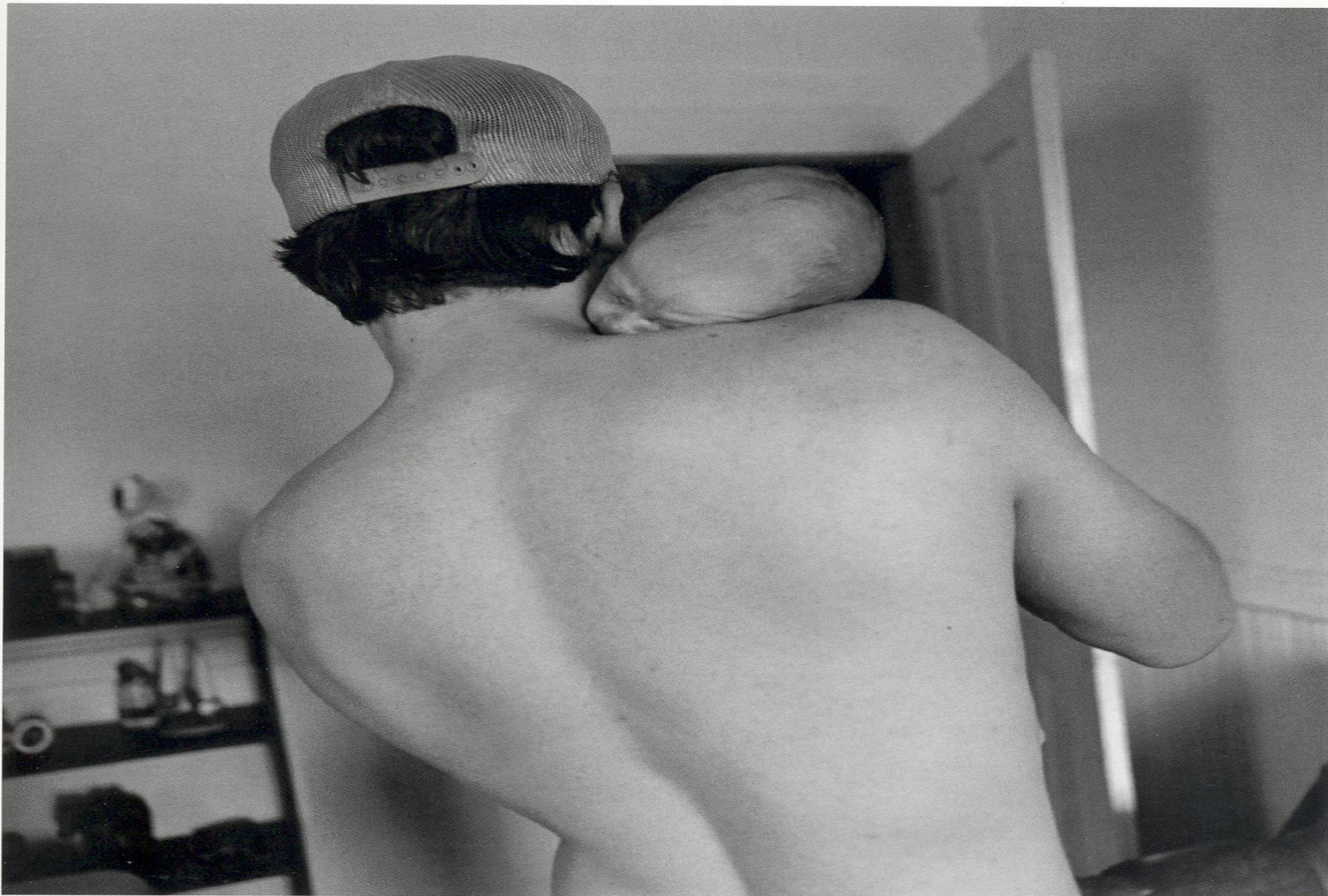
Henderson, North Carolina, 1989